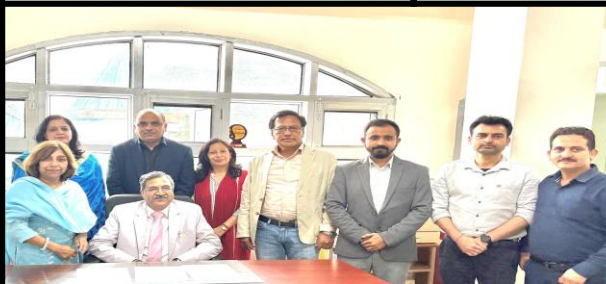
Institution of Vocational Studies (IVS), Faculty

This year in 2025, IVS takes pleasure in launching the maiden issue of its Newsletter ' IVS Strides – Scaling New Horizons '. Henceforth, the Newsletter will be published bi-annually, for Spring and Fall Semester each. The Spring 2025 issue provides a kaleidoscope of snippets of the Institute, its programs and engagements of faculty and students, which have all contributed valuably to creating a distinct identity of the Institute of Vocational Studies, both nationally and internationally. Since its establishment in 1992, over a span of more than three decades, the Institute steadily continues to gain prominence in the academic arena by strengthening its Tourism and Hotel Management programs that aim at offering quality education and training, leading to prestigious placements in the industry and academics. The Institute is proud to produce exemplary entrepreneurs, intellectually oriented scholars and mould potential faculty for academic institutions. As the Institute continues to make its strides towards scaling further horizons, IVS promises to contribute towards enhancing the identity of H.P. University.