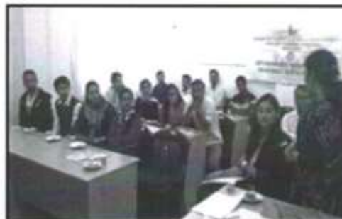
Interaction with audience