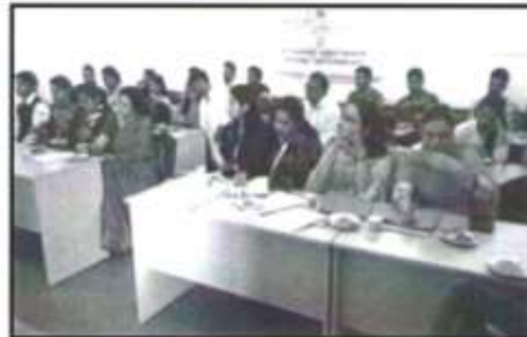
Participants enjoying Refreshment