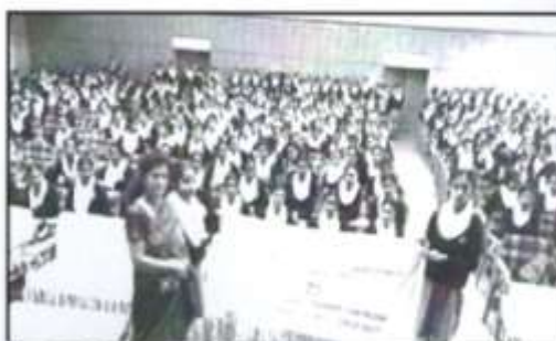
Beti Bachao Beti Padhao campaign was organized by Centre on 12 th October 2017 in Senior Secondary Girls School Portmore