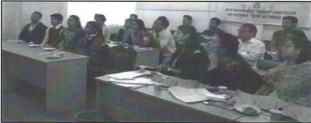
Judges of Debate Competition